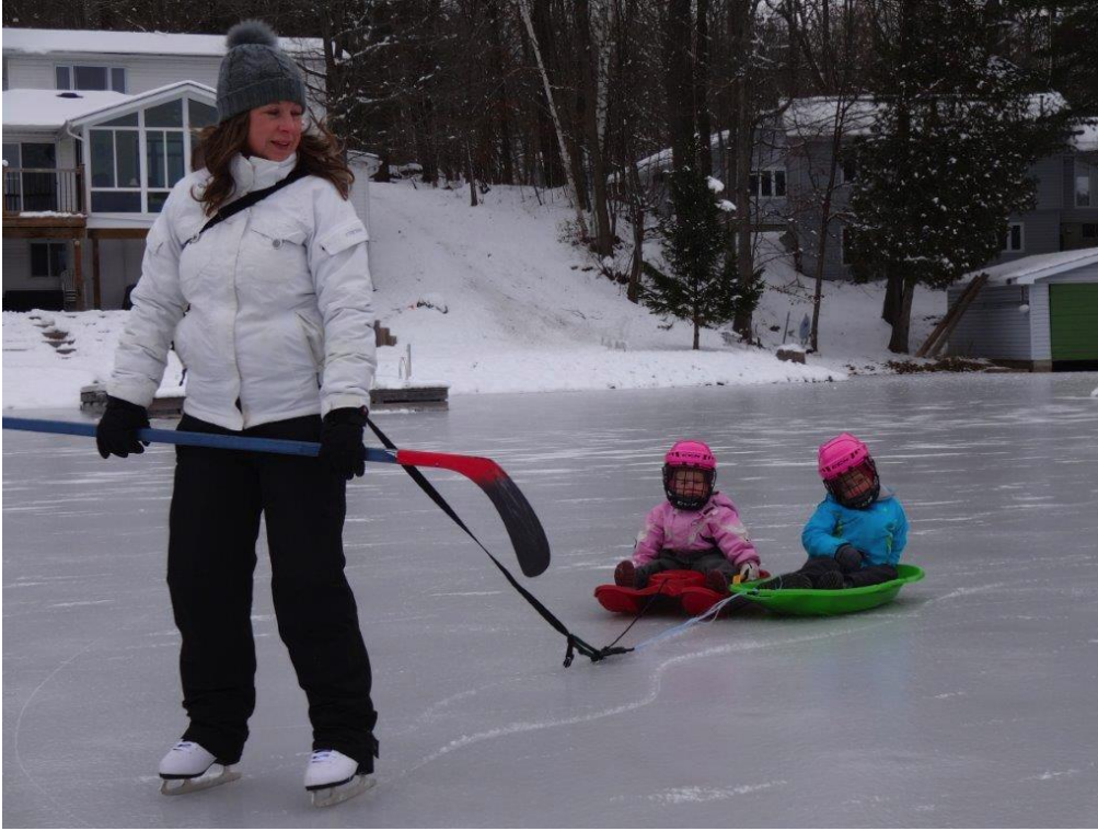
Some skating fun November 30, 2013

In order to promote the spirit of Buck Lake People, we invite your comments and suggestions for newsletter articles or announcements. Mail to: info@bucklake.ca