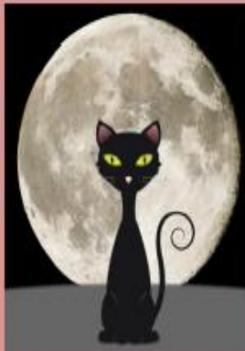
Bell, Book and Candle July 8 to 31, 2011

Ottawa Valley's Professional Summer Theatre