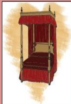
The Fourposter Aug. 5 to 28, 2011