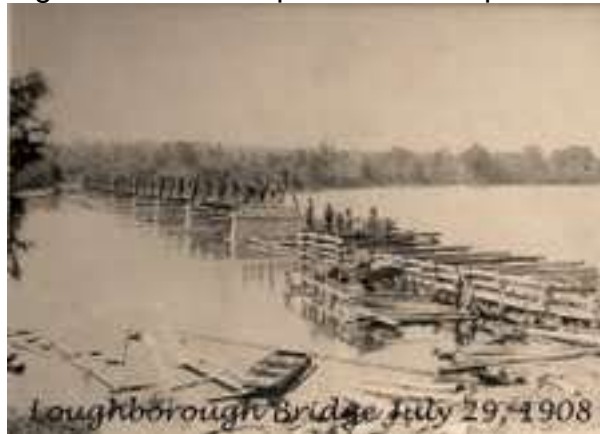
The original Loughborough Bridge